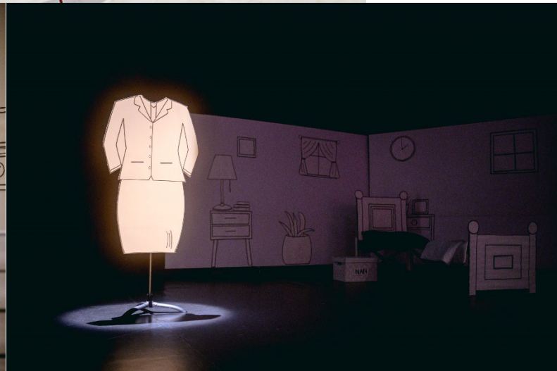
Sample photos of props, Set Design by Colleen Best, and Lighting Design by Bob Stamp – Venus's room.