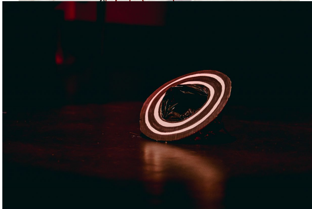
Sample photo of Set Design by Colleen Best, and Lighting Design by Bob Stamp – The Black Hole